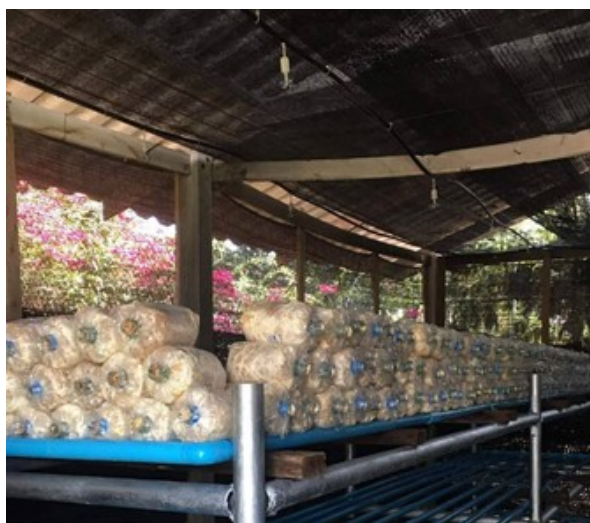
Fig. 2: Mushroom growing chamber with automated mist irrigation system.

Treatment specifications were as follows: