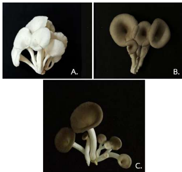
Fig. 3: Fruiting body characteristics of three Pleurotus species cultivated under controlled environmental conditions: (A) Pleurotus ostreatus

Notes: *indicates significant differences at the 95% confidence level; For the DMRT, means with different vertical letters, i.e., a, b, and c, demonstrate significant differences in the groupings at the 95% confidence level.